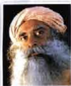
Sadhguru, Jaggi Vasudev, loving called as 'Sadhguru' is a yogi and profound mystic, visionary humanitarian and a prominent spiritual leader. A contemporary Guru, who is as comfortable in jeans as in a loincloth, Sadhguru works tirelessly towards the physical, mental, and spiritual well-being of all.

Our mind is not a thing to control. It's there so we can use it for our benefit