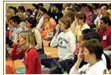
Participants practice Sukha Kriya during an Isha Foundation event.

Any engineering is to create the situation or atmosphere the way we want it. We're really good at engineering our exterior the way we want it – at great cost to all other species and the Earth itself. External engineering has brought us a lot of comfort and convenience. We can say we are the most comfortable generation ever on this planet. At the same time can we claim to be the most peaceful generation? Most loving? Most happy? Anything like that? After all, with everything we do in our life we are only seeking to be happy. But that's not happening simply because we don't handle our body, mind, emotions and energies properly.